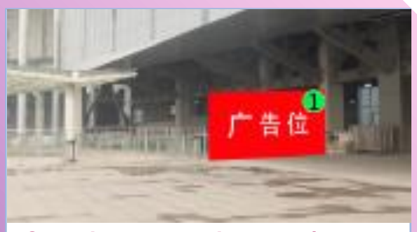
C05 Billboard beside East / West registration hall entrance

Specification: 4m (H) x 8m (W) Price: USD 5,000