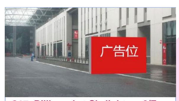
C07 Billboard at Skylight on 2/F

Specification: 3m (H) x 6m (W) Price: USD 2,750