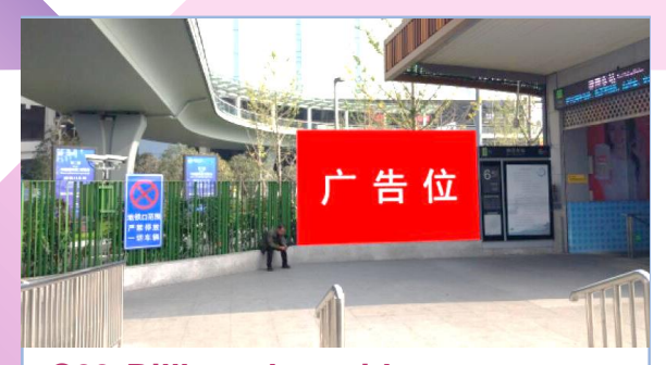
C03 Billboard outside metro station exit 6

Specification: 3m (H) x 12m (W) Price: USD 5,500