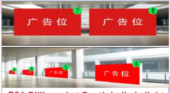
C04 Billboard at South hall skylight

Specification: 3m (H) x 5m (W) Price: USD 3,000