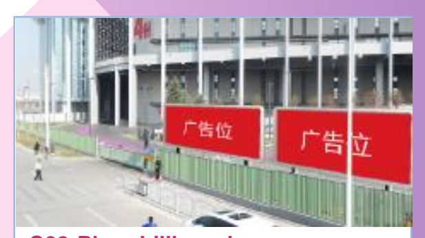
C02 Plaza billboard

Specification: 3m (H) x 12m (W) Price: USD 5,500